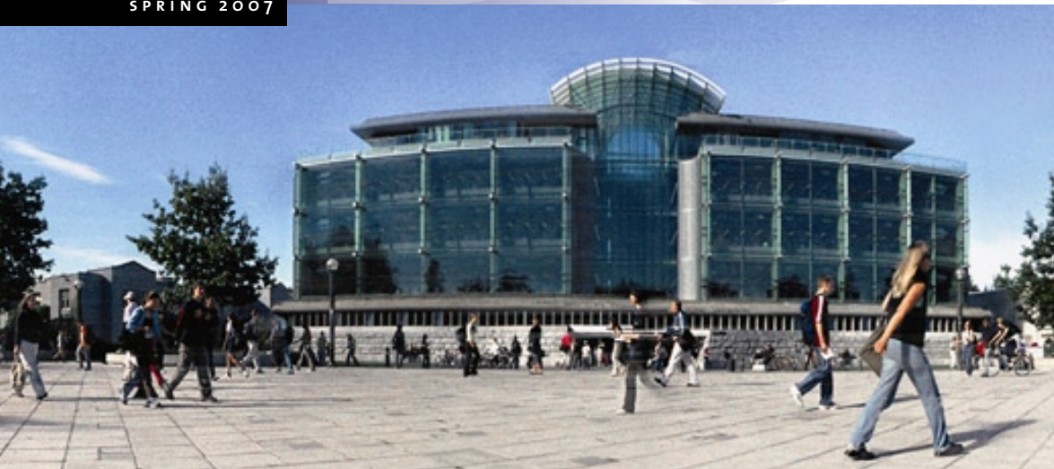
Koerner Library: A hub of activity at UBC.